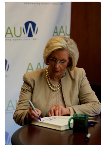
Lilly Ledbetter signing Grace and Grit At an AAUW Lobby Corps lunch.